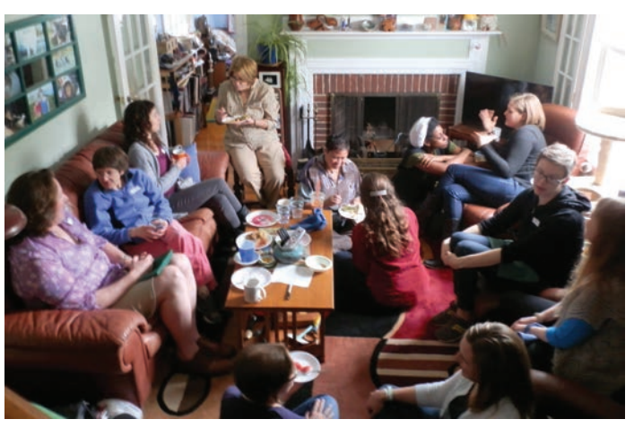
At the May brunch

September 23<sup>rd</sup> is Celebrate Bisexuality Day! Plan an event in your community to celebrate our rich and vibrant culture.