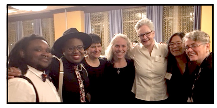
What some of us look like. Some of the bi+ folks who attended MassEquality's Icons Event in Boston on March 22, 2018

Does your dress change according to where you are going out on 'the scene'?