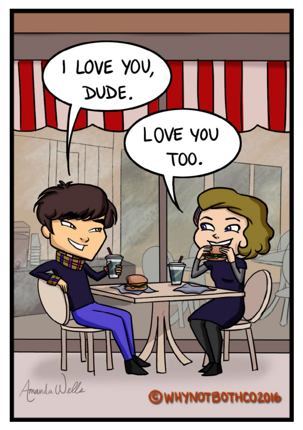
"True Friendship" by WhyNotBothCo