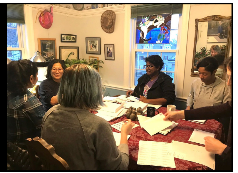
February Stuff & Stuff

If you are in the Boston area, please consider joining us at one of our events. We host monthly brunches, and every three months there is a "Stuff & Stuff," where we prepare the print mailing of this publication. Check out our calendar (page 24) for dates of upcoming events.