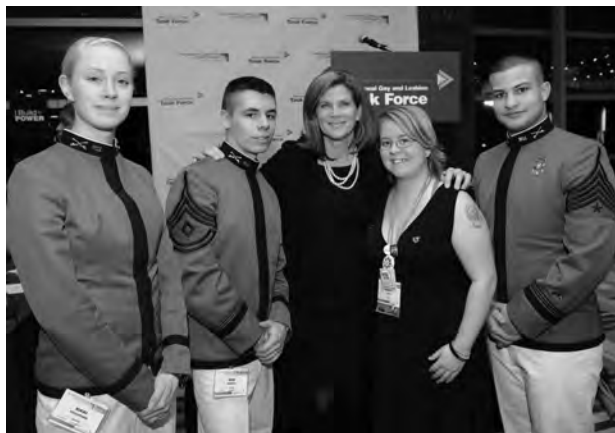
Norwich University students at Creating Change with Katie O'Malley, wife of Maryland's Governor.